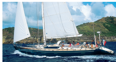
GRAND BLEU II - BRIAND 76 - 1991