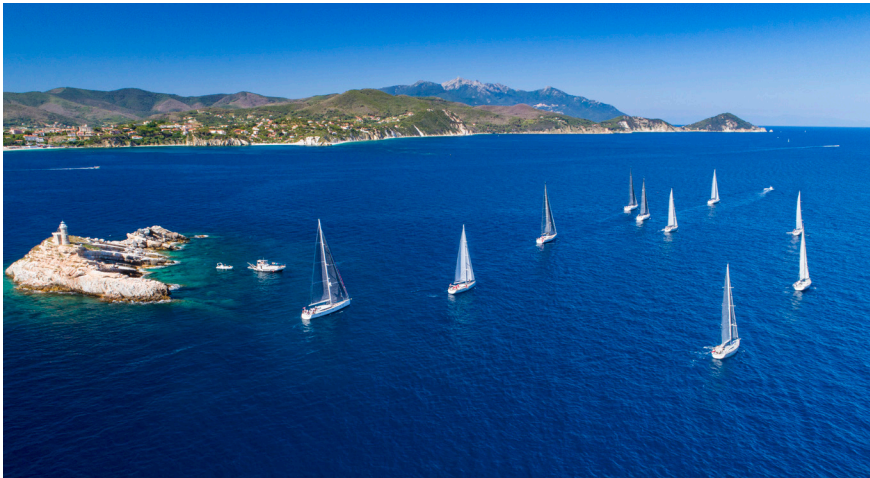
CNB Rendez-Vous 2018

3 • Dedicated press Sea Trial on board CNB 66 at Cannes Yachting Festival