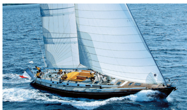
CNB 76 - KALIKOBASS - GERMÁN FRERS - 1991