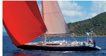
CNB 77 - DEEP BLUE - PHILIPPE BRIAND - 2001