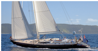
CNB 77 - CHRYSALIS T - PHILIPPE BRIAND - 2002