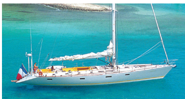
CNB 76' - MARICEA - GERMÁN FRERS - 1990