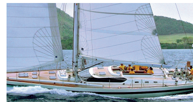
NARVAL II - BRIAND 76 - 1991