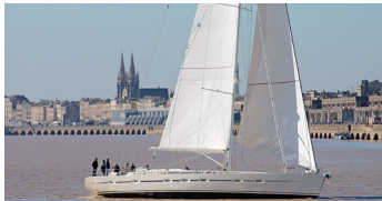
CNB 92' - VIVA - PHILIPPE CABON - 2002