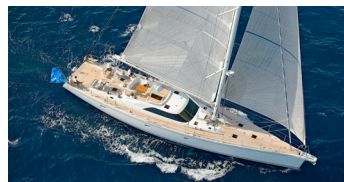
CNB 82 - SIMERON - TONY CASTRO - 2004