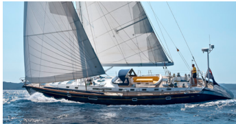
CNB 64 - HAVANA - BRUCE FARR - 2001