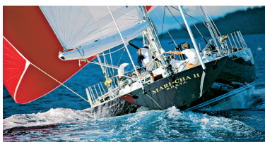
CNB 92' - MARICHA II - GERMÁN FRERS - 1989