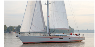
CNB 77 - SWALLOW & AMAZON - PHILIPPE BRIAND - 2009