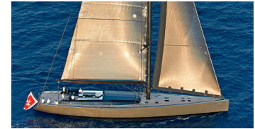
CNB 100 - CHRISCO - LUCA BRENTA - 2009