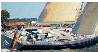
CNB 74 - JOY - SEBASTIEN MAGNEN - 2003