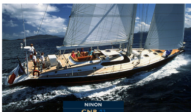
CNB 76' - NINON - PHILIPPE BRIAND - 1990