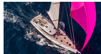
CNB 66 - 2017 -> 2018 - 12 BATEAUX CONSTRUIITS