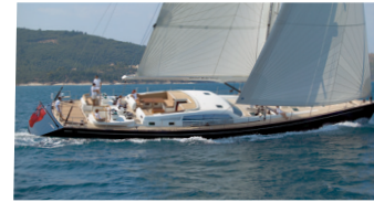
CNB 95 - INFINITY - PHILIPPE BRIAND - 2008