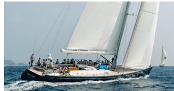
CNB 104 - ONLY NOW - GERMAN FRERS - 2002