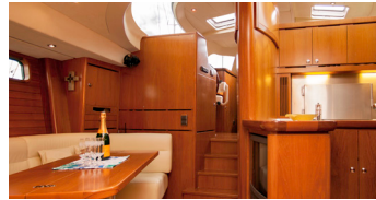
CNB 65' - BLUE SKY MESSENGER - SPARKMAN & STEPHEN - 2001