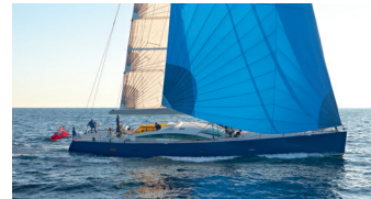
CNB 86 - SPIIP - PHILIPPE BRIAND - 2009