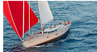
CNB 77 - AMAZON CREEK - PHILIPPE BRIAND - 2010