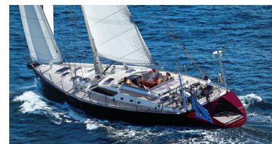
CNB 76' - LILLA - PHILIPPE BRIAND - 1993