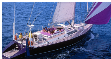
CNB 76' - XTC - PHILIPPE BRIAND - 1993