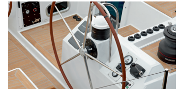
CNB 77 - VANINA - PHILIPPE BRIAND - 2010