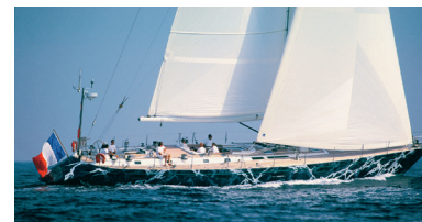
CNB 76' - VIVANT - GERMÁN FRERS - 1994