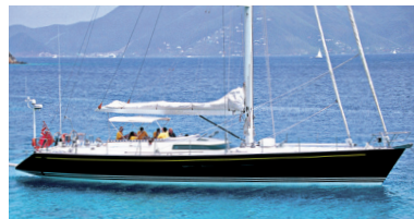
CNB 70 - SAGITTARIO - PHILIPPE BRIAND - 1997