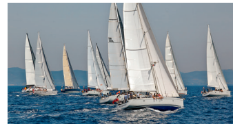
BORDEAUX 60 - 2009 -> 2015 - 46 BATEAUX CONSTRUIITS