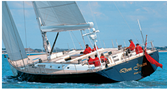
CNB 95' - DON JUAN - GERMAN FRERS - 1999