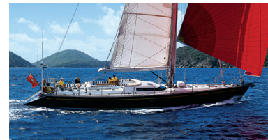
CNB 70 - EXCALIBUR - PHILIPPE BRIAND - 1998