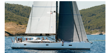
CNB 76 - 2013 -> 2015 - 22 BATEAUX CONSTRUIITS