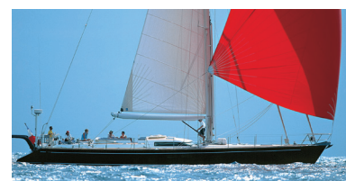
CNB 70 - BLUES - PHILIPPE BRIAND - 1995