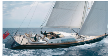
CNB 95 - GRAND BLEU VINTAGE - PHILIPPE BRIAND - 2003