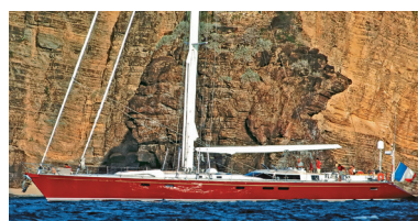
CNB 106' - VICTORIA T - BRUCE FARR - 1994