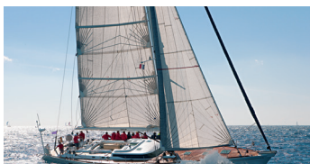
CNB 77 - SPIP - PHILIPPE BRIAND - 2006