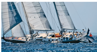
CNB 87' - CHATEAU BRANAIRE - GERMÁN FRERS - 1989