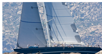
CNB 117 - HAMILTON II - PHILIPPE BRIAND - 2005