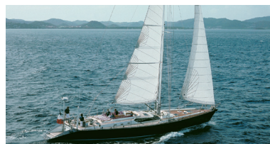
CNB 76' - GRAND BLEU III - PHILIPPE BRIAND - 1992